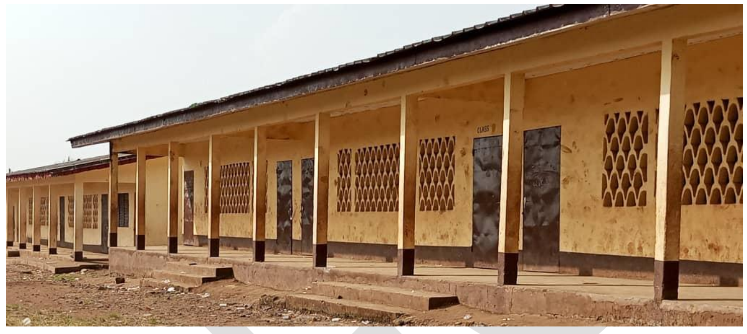
Bomaka School classroom buildings